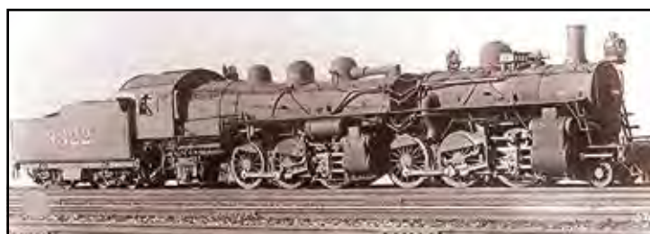
*"MALLETT" LOCOMOTIVES (pronounced mal-LAY) had two steam boilers on a flexible frame. They were run from one cab, supposedly doing the work of two locomotives with a single crew. But the design was flawed because the two small boilers made only enough steam to move the long engine and a train at barely 15 mph. The Santa Fe Railway owned a few of the locomotives but had rebuilt most of them by 1926. It was likely the type above that hauled wheat from Protection that summer.

Next week will be the final week of the big tent revival of the First Church of God in Protection, located at Main and Broadway. Interest and attendance continues to be good.