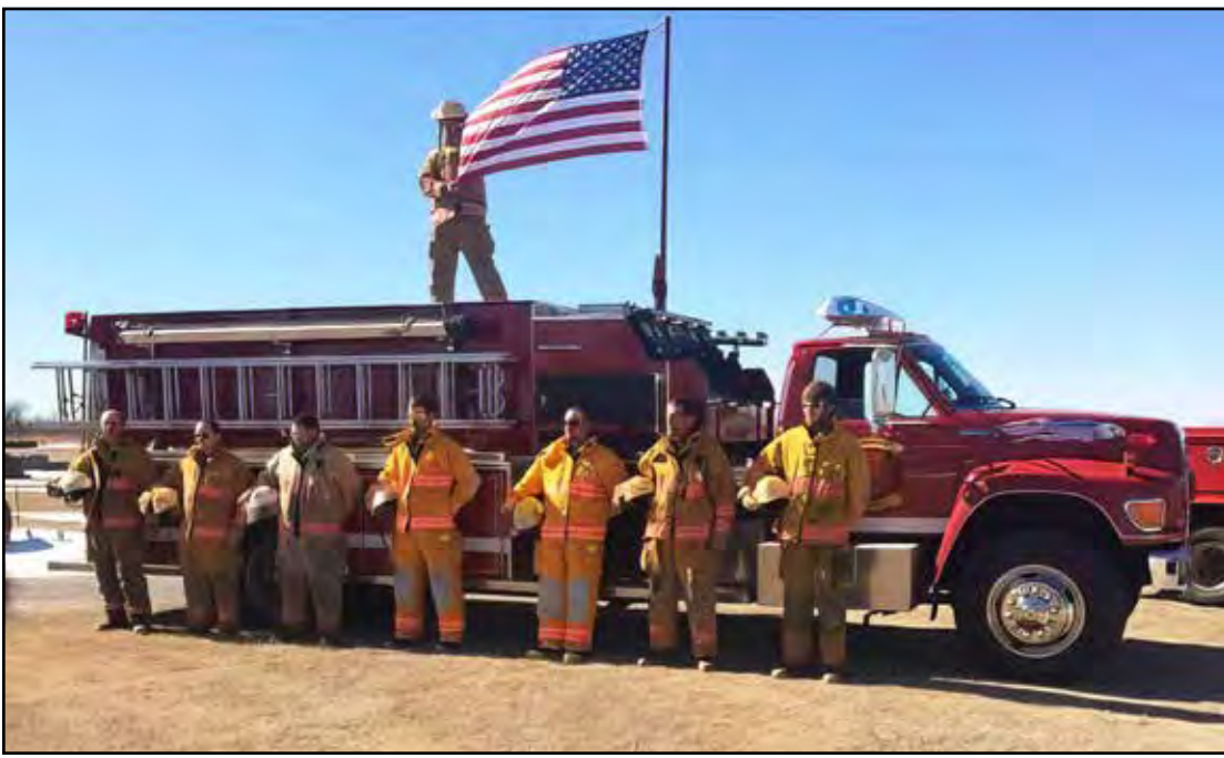
COMANCHE COUNTY FIREFIGHTERS.