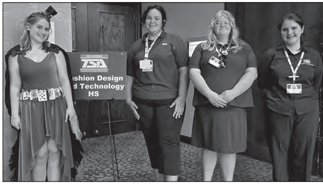
POND CREEK-HUNTER SCHOOLS

“This premier event allows participants to showcase