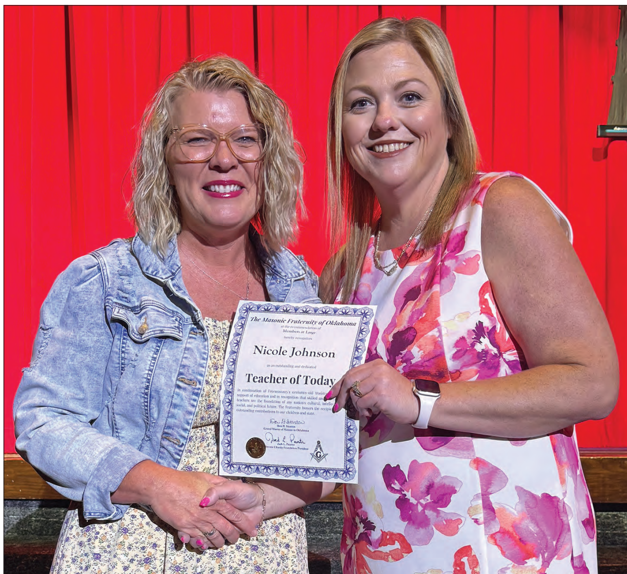
MEDFORD PUBLIC SCHOOLS