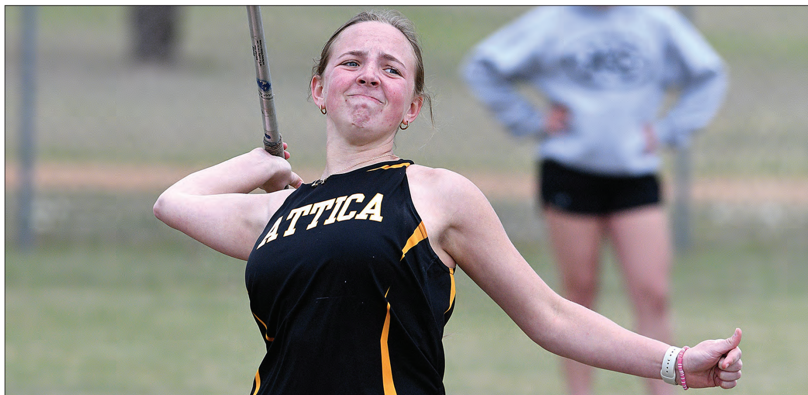
JASON JUMP / The Independent

The Kansas Department of Transportation posted on its Twitter feed that U.S. Highway 160 was closed west of Attica because of law enforcement in the area.